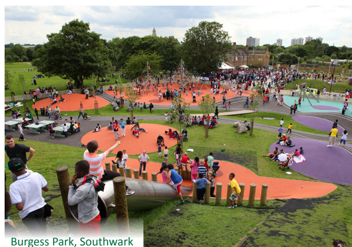
Burgess Park, Southwark

The Fields in Trust Guidance for Outdoor Sport and Play is available in versions for England, Scotland and Wales, plus a Welsh language version